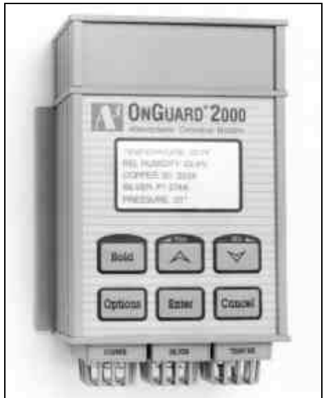
Figure 3 - OnGuard 2000 Environmental Reactivity Monitor