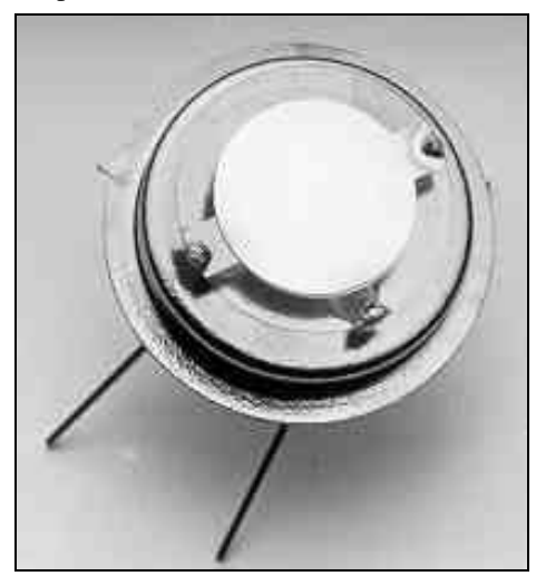
Figure 2 - Quartz crystal microbalance